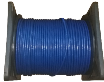
305m/Inner reel packaging