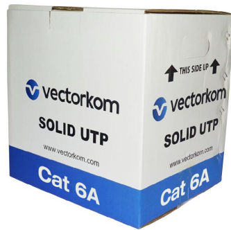
Outer carton packaging